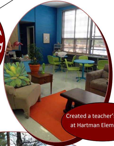
Created a teacher's lounge at Hartman Elementary