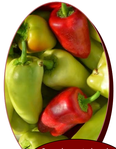
Grew, harvested, and donated over 600 lbs of vegetables