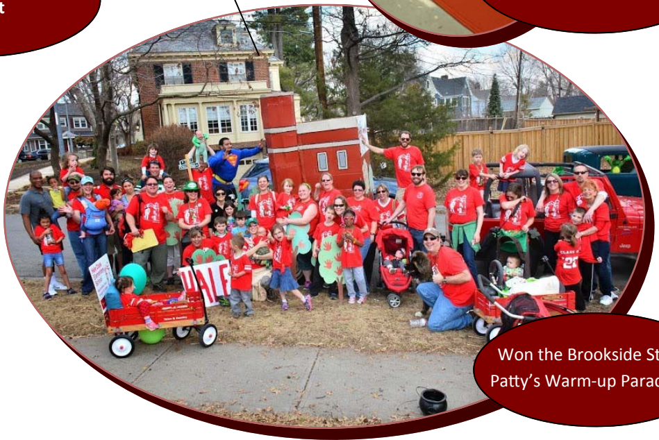
Won the Brookside St. Patty's Warm-up Parade