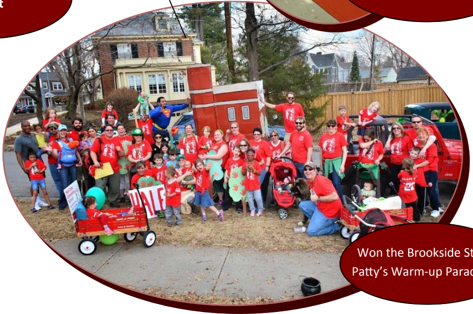
Won the Brookside St. Patty's Warm-up Parade