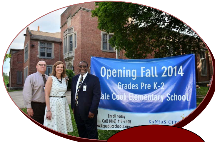
Aided in selection of a principal