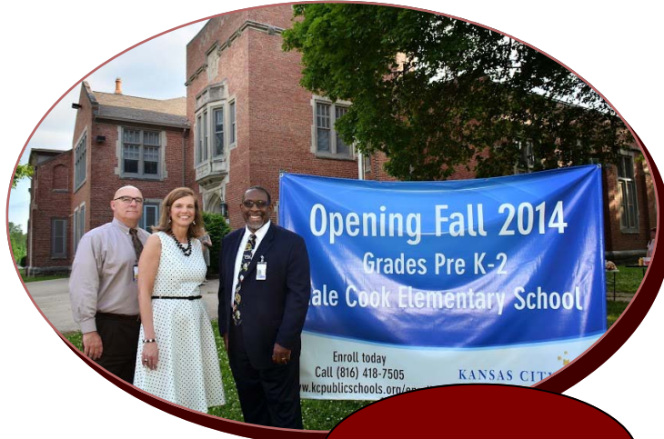
Aided in selection of a principal