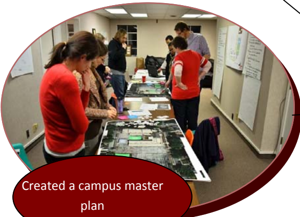
Created a campus master plan