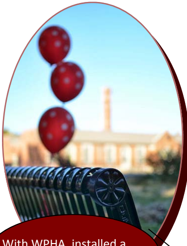
With WPHA, installed a bench in the orchard