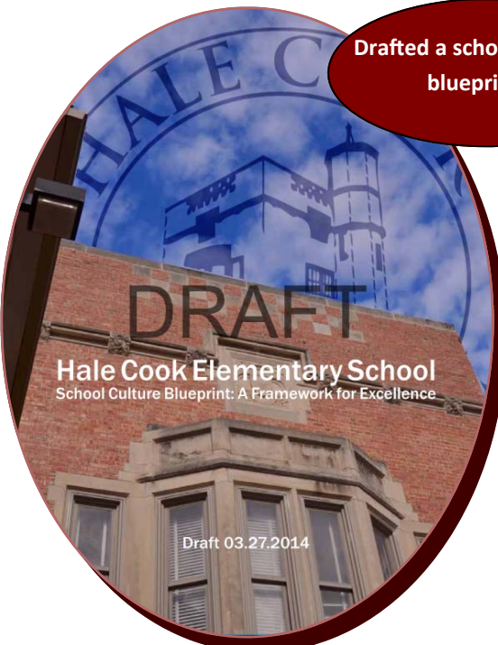
Drafted a school culture blueprint