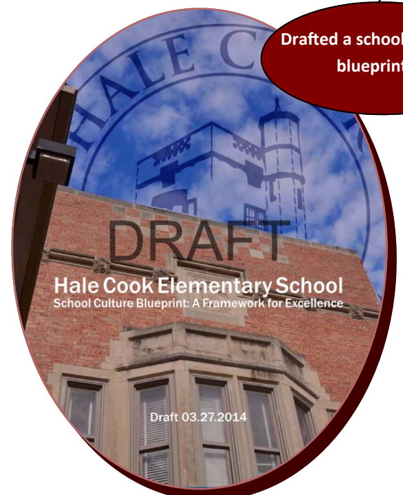
Drafted a school culture blueprint